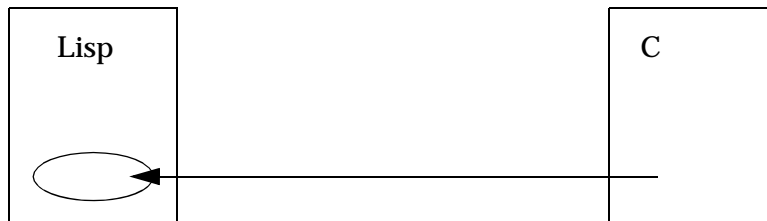
Figure 4.2 C calling a callable function in Lisp.

Callable functions are defined using fli:define-foreign-callable , which takes as its arguments, amongst other things, the name of the C function that will call Lisp, the arguments for the callable function, and a body of code which makes up the callable function.